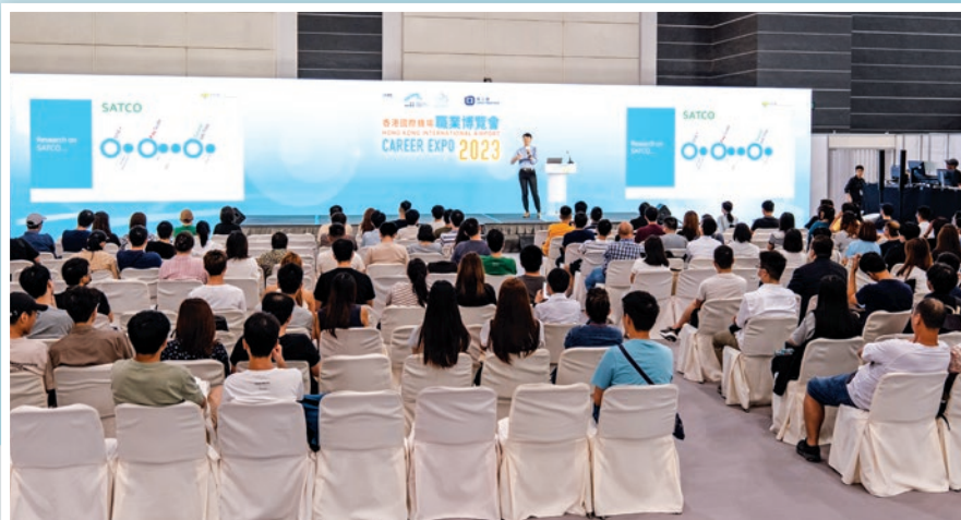
Attendees gain valuable job information and insights into career planning at career talks hosted by various companies. 多家公司舉行就業講座，向參加者提供寶貴的就業資訊及職業生涯規劃意見。

Addressing the ceremony, HKSAR Secretary for Transport and Logistics Lam Sai-hung highlighted that the Three-runway System is on track for completion by the end of next year. This significant development, along with other associated projects under the Airport City vision, will greatly enhance the capacity and functionality of HKIA, offering unprecedented opportunities to the aviation industry in Hong Kong.